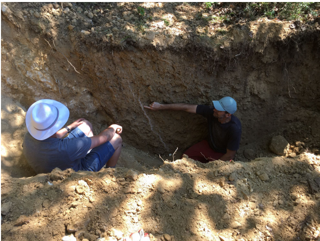
Fig. 2 Detail picture of a trench wall excavated across the causative fault. This is from the first trench out of a dozen that was dug during the 2020 spring; notice the fracture in the colluvium related to a pre-historical activity, with the two authors for scale.