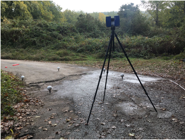
Fig. 1 This tiny scarp on the La Rouvière tar road was the first evidence of Le Teil earthquake-related ground rupture uncovered by the field team (2 days after the event). The equipment is a laser scanner to image accurately the offset.